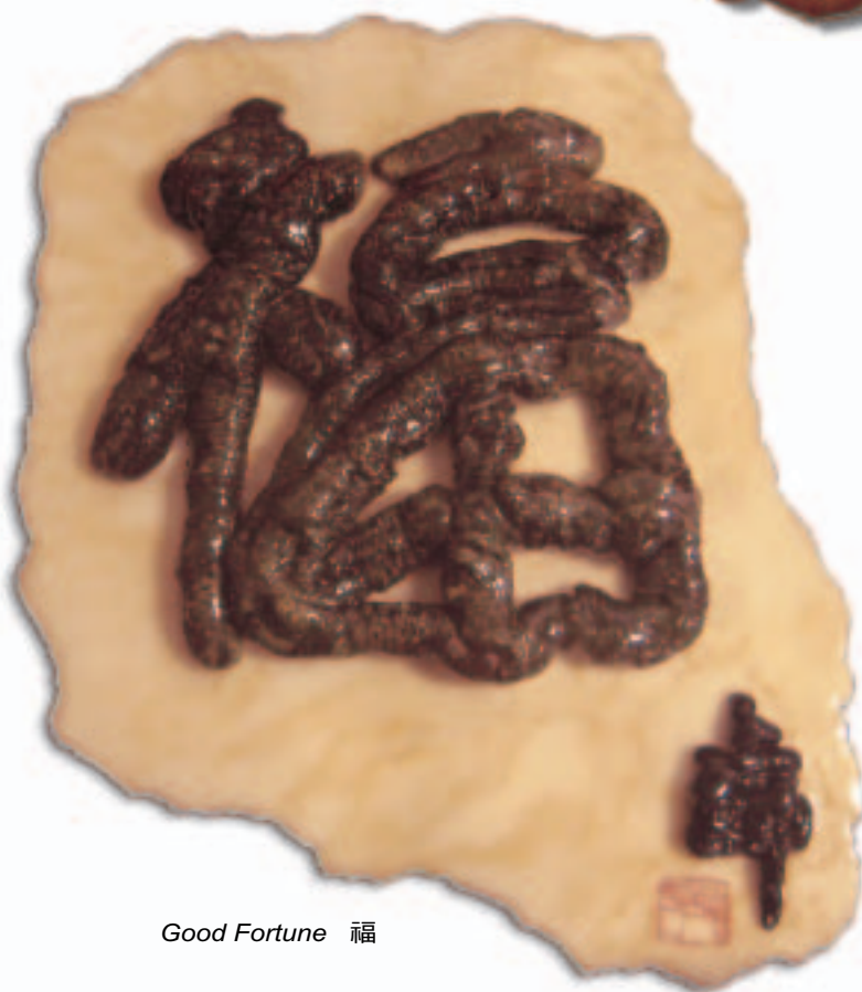
Good Fortune 福