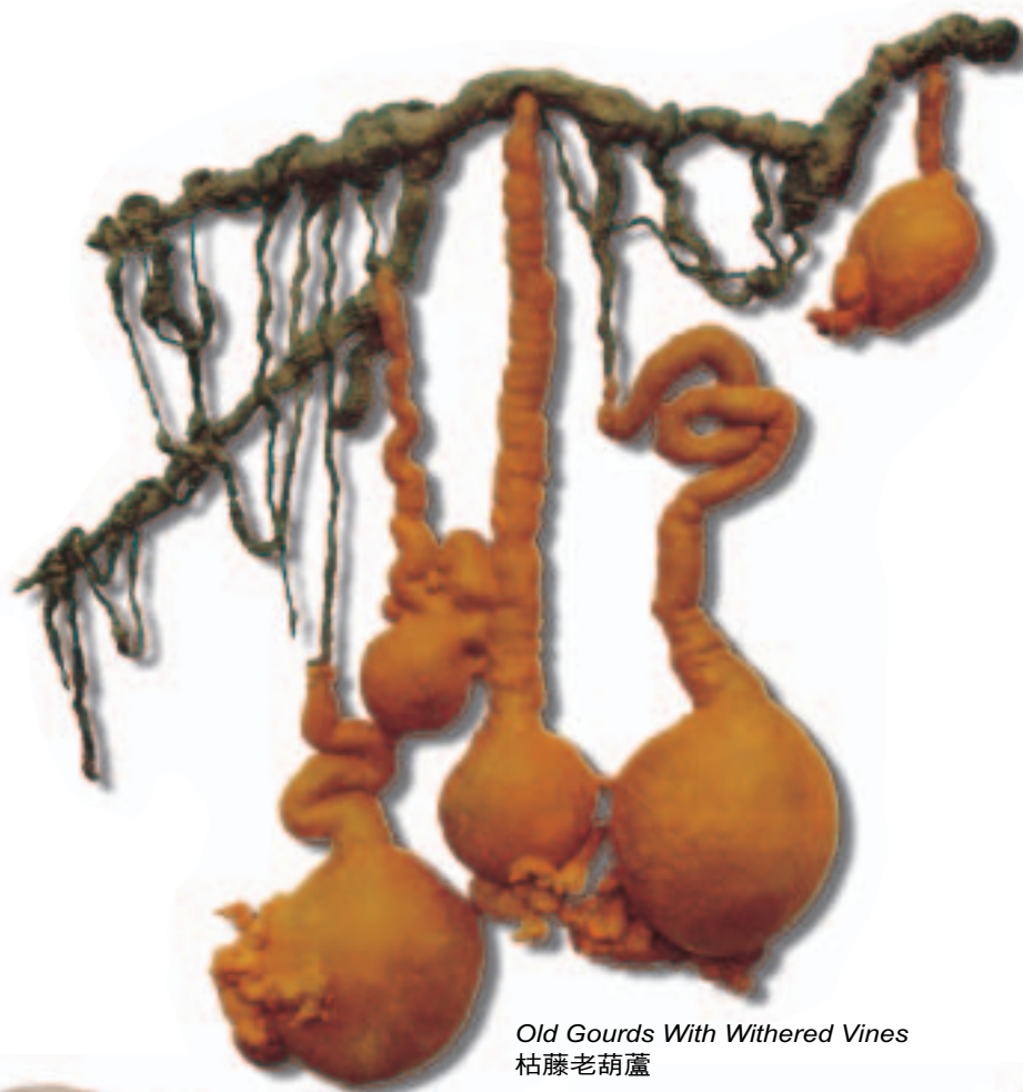
Old Gourds With Withered Vines 枯藤老葫蘆