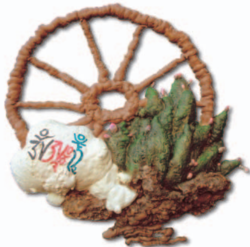
Mani Treasure 瑪尼藏