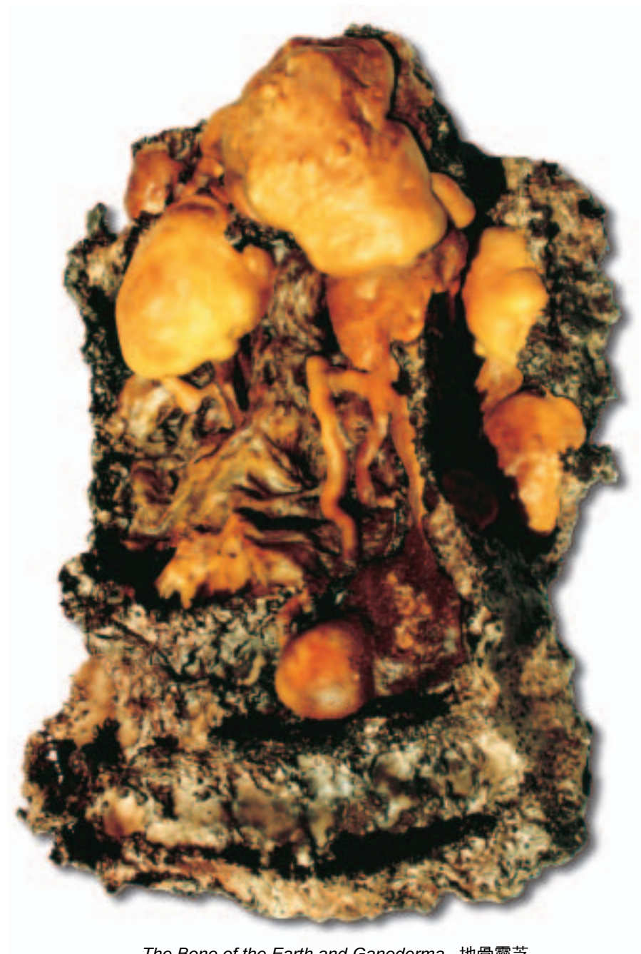
The Bone of the Earth and Ganoderma 地骨靈芝