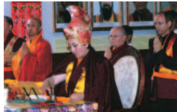
Wearing a dharma hat, Venerable Akou Lamo Rinpoche conducts a Dharma Assembly for rinpoches, dharma teachers, and laypersons.