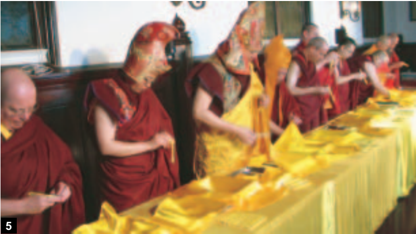
5 After all of the sealed 120 lots were mixed up, a third group consisting of ten rinpoches sheathed each of the identically-looking lots. This all the more made it impossible to determine the number of each lot. 將120支已經密封的大籤混亂後，再換上第三組十位仁波且把沒有差別的籤裝到籤套裡，這樣就徹底無法辨認哪一支籤是多少號了。