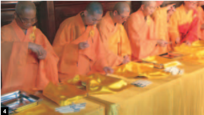
4 A second group of eight monastics is putting the numbered lot slips into the slit of each lot. After a numbered lot slip is put into a slit, the slit is immediately sealed with tape. Before this was done, all of the numbered lot slips were mixed up and all of the lots were also mixed up. They were then randomly divided and put onto several trays. After all of the numbered lot slips were put into all of the lot slits and sealed, satin sheaths were used to sheathe each lot. The monastics put the numbered lot slips into the lot slits by randomly picking up a lot, randomly picking up a lot slip, and inserting the lot slip into the lot slit. After the slip was inserted, the slit was immediately sealed with non-transparent tape. After each lot was sealed, all 120 lots looked exactly the same. 換上第二組八位出家人現在將籤號牌裝進大籤槽口裡面，當下貼上封條。裝籤的辦法是先将籤號牌和大籤各自混亂，隨意分成多盤，再用黃緞布密蓋。裝籤時隨意摸到哪一支大籤和任意一個籤號牌，即將此籤號牌裝進該大籤的槽口內，馬上用不透明的膠帶密封。所有密封後的120支大籤完全相同，沒有差別。