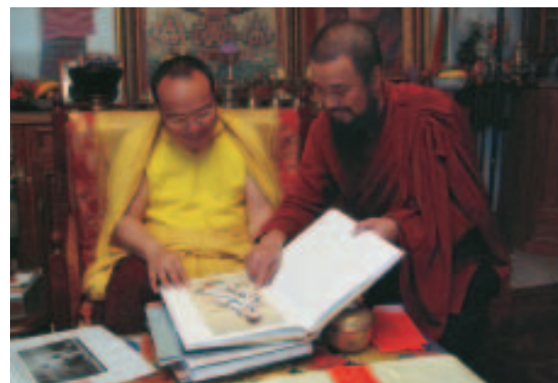
A photograph of Venerable Khu-ston brTson-'grus g.yung-drung V Henghsing Gyatso Rinpoche together with H.E. the 12 th Tai Situ Rinpoche 庫頓尊哲雍仲尊者第五世 恆性嘉措仁波且與泰錫度 仁波且合照相片