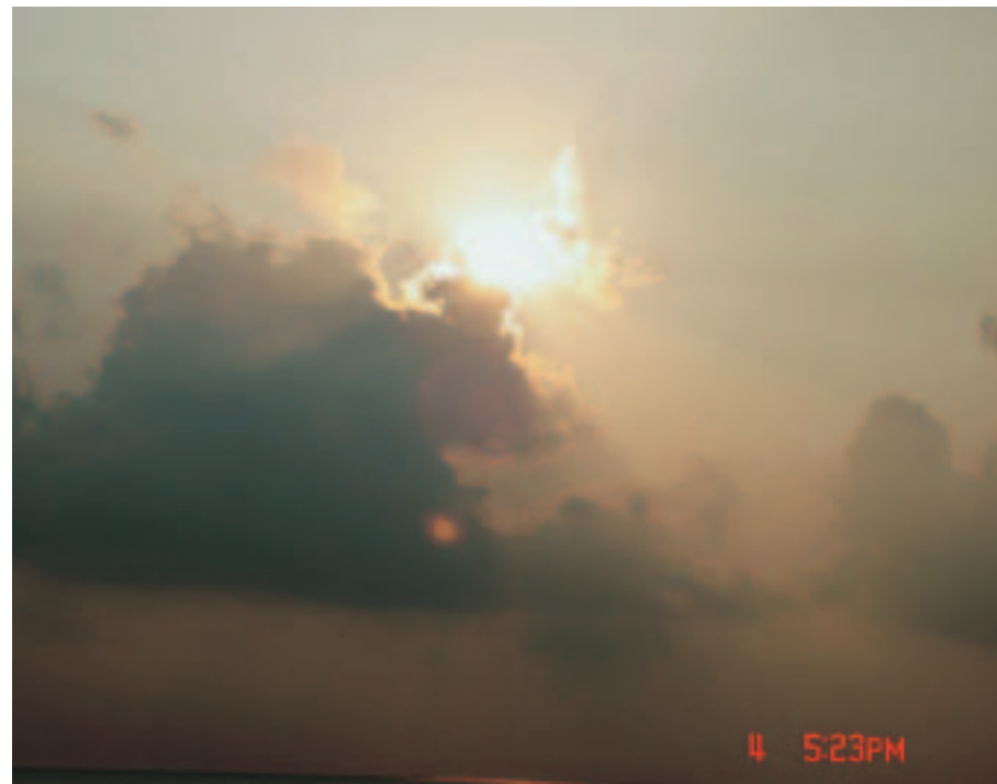
The holy photograph of Kuan Yin Bodhisattva appearing in the sky 觀世音菩薩在空中出現的聖影