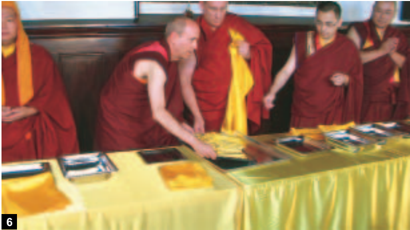
6 After going through four mixing phases and after going through a sealing process carried out by three different groups of dharma teachers and rinpoches, those 120 lots sheathed in yellow satin are now truly sealed lots that are completely indistinguishable. 120支籤經四道程序相互摻混，由三批不同的法師、仁波且分別密封完畢，現在這個裝進黃緞布套的籤完全成了密不可判的真正密封籤。