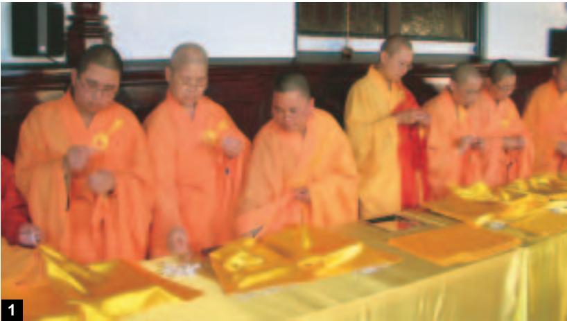
1 Under the observance of the seven types of Buddhist disciples, the first group of eight monastics began sticking numbered pieces of paper onto the ivory slips that would be inserted into the lots to indicate the number of each lot. All of those ivory slips were completely the same and had been thoroughly mixed up. 在七眾佛教徒的圍觀下，第一組八位出家人開始將編了號的籤號紙黏貼在完全同樣無差別而被混亂過的牙骨片上，成了籤號牌。

Different groups of monastics and rinpoches seal up the numbered lot slips. 分不同的幾組出家眾和仁波且們，正在密封牙骨籤