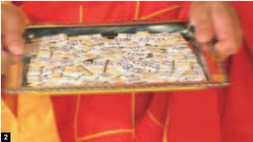
2 These are all of the 120 numbered lot slips after a number was stuck onto each of them. Their numbers started with 1 and went up to 120. No numbers were missing between 1 and 120. The dharma teachers placed them on a silver tray and are mixing them up by shaking them. 已經黏貼完的120片籤號牌，它們的號碼是從1號到120號，中間是連續的，沒有間斷。法師們放在銀盤中正搖動混亂。