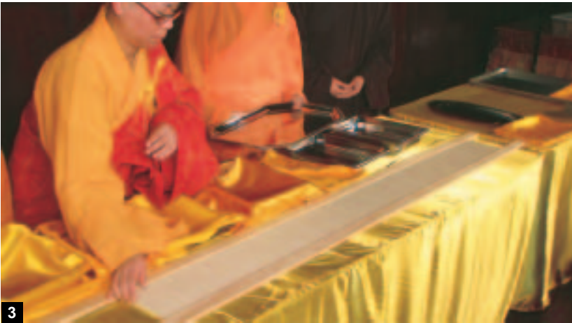
3 All of the lots are placed flat between two straight boards. The length, size, texture, and color of all 120 lots were completely the same. Everyone is examining the lots to verify that they all are the same. 正在把大籤經兩條木排平在中央，120支大籤長短、大小、質地、色澤全部一樣，大家鑒證所有籤同樣沒有差別。